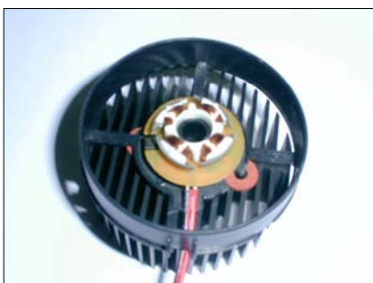
Step 3: assemble fan's bearing