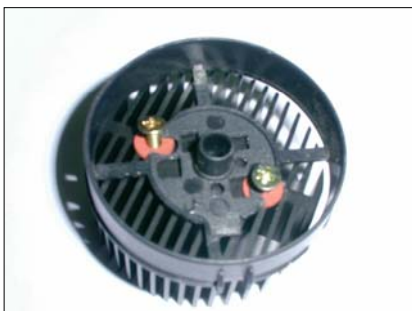
Step 2: put washers on top of screw holes, then set fan base and tighten screws