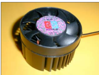
Step 5: finish

ROITHNER LASERTECHNIK A-1040 Vienna, Austria Schoenbrunner Strasse 7 Tel.: +43-1-586 52 43 - 0 Fax.: +43-1-586 52 43 44 e-mail: office@roithner-laser.com http://www.roithner-laser.com