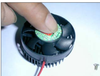
Step 4: set fan leaves and push structure it lightly